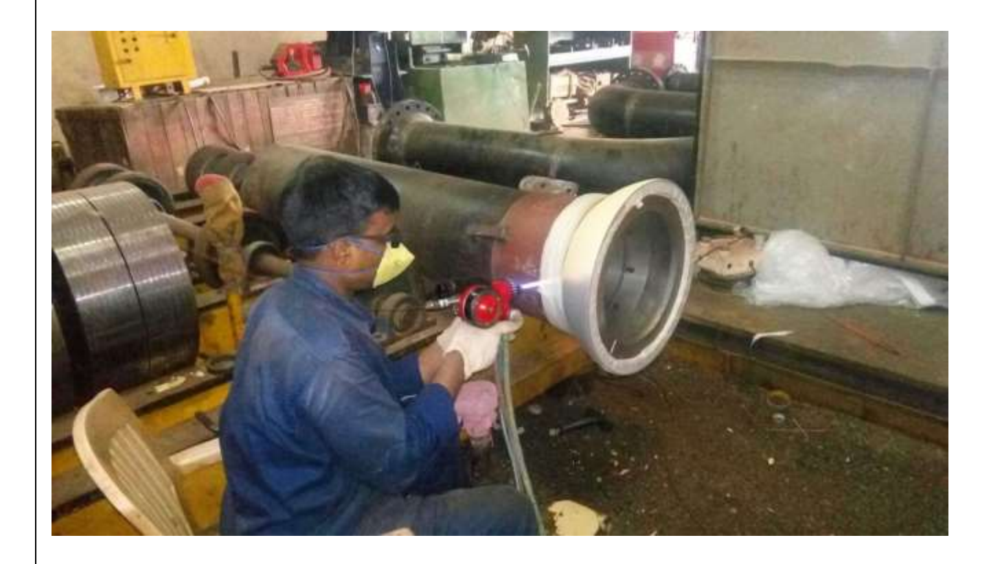
Aluminium Bronze Thermal Spraying on Suspension Body