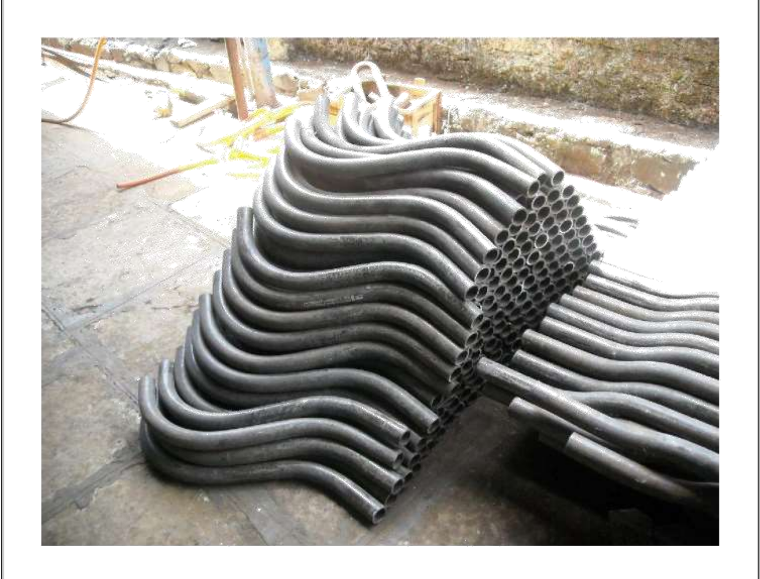
TUBE BENDING FACILITY