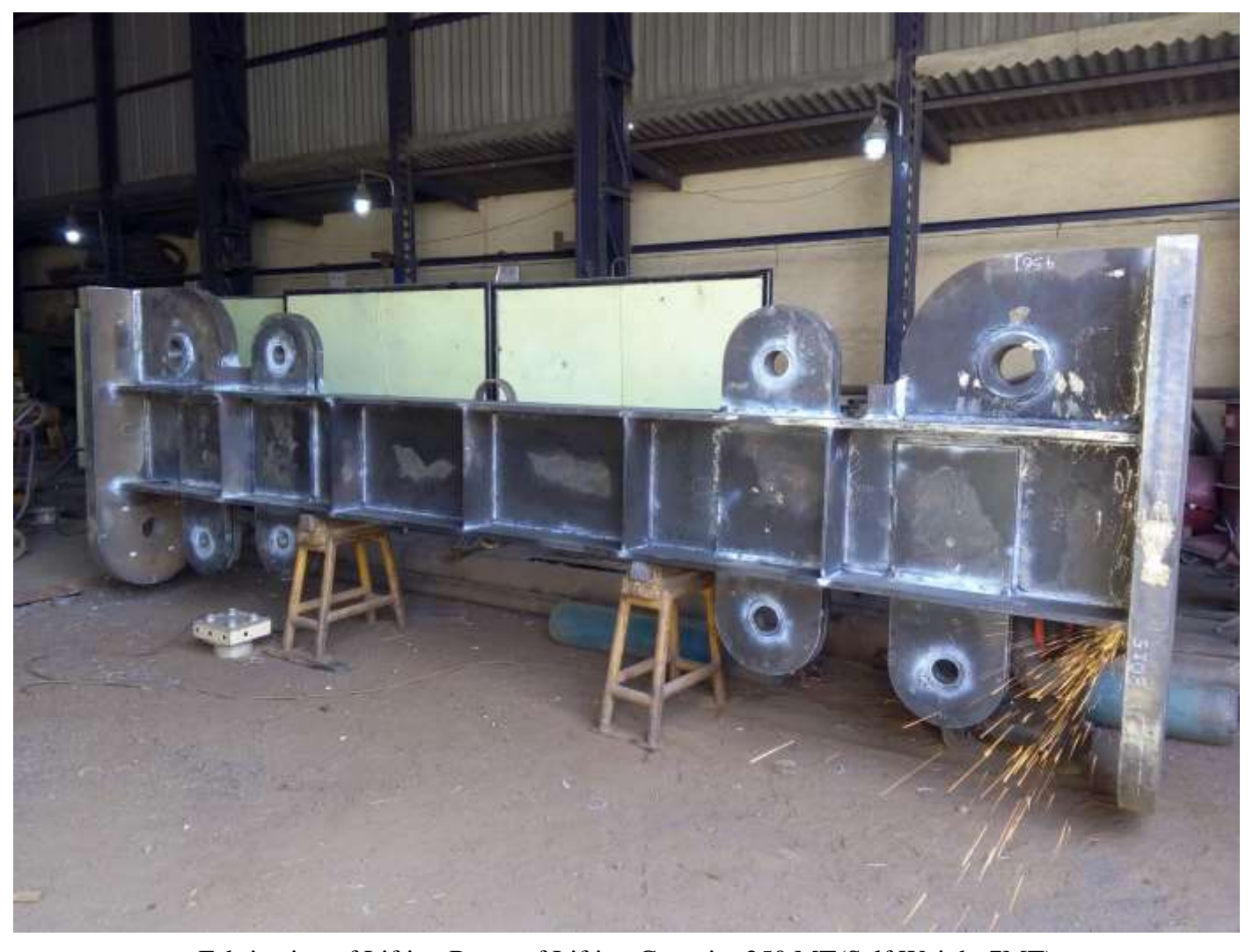
Fabrication of Lifting Beam of Lifting Capacity 250 MT(Self Weight 7MT)