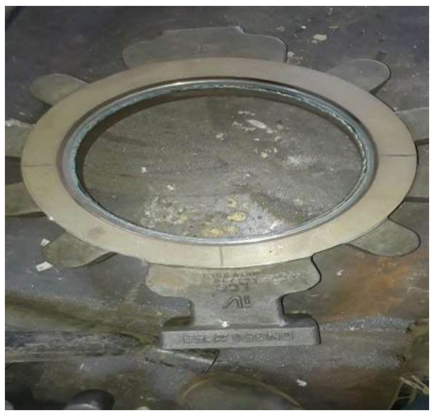
Stellite 21 overlay on Butterfly Valve bodies