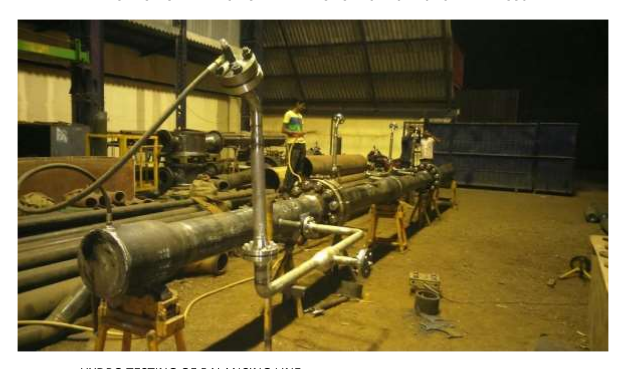
HYDRO TESTING OF BALANCING LINE