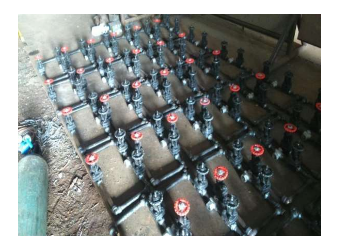
FABRICATION & SUPPLY OF STEAM TRAP MODULES AS PER IBR 1950