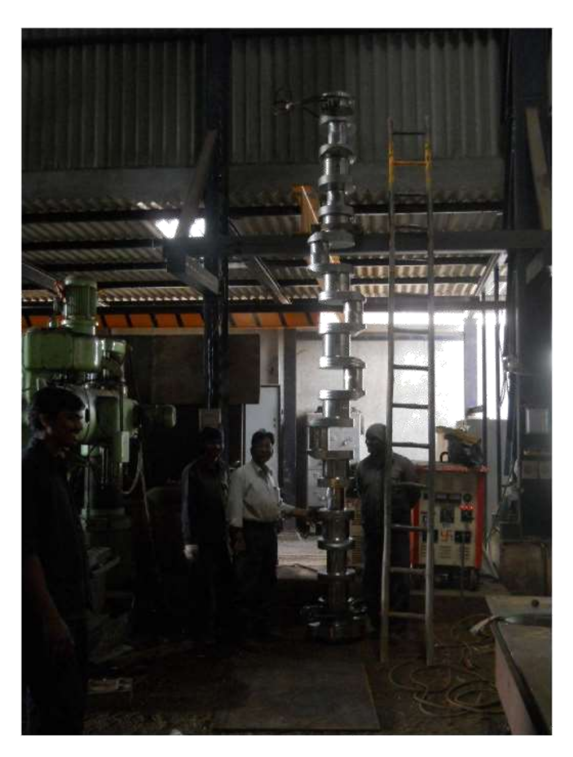
COUNTERWEIGHT WELDING ON LOCOMOTIVE CRANKSHAFT