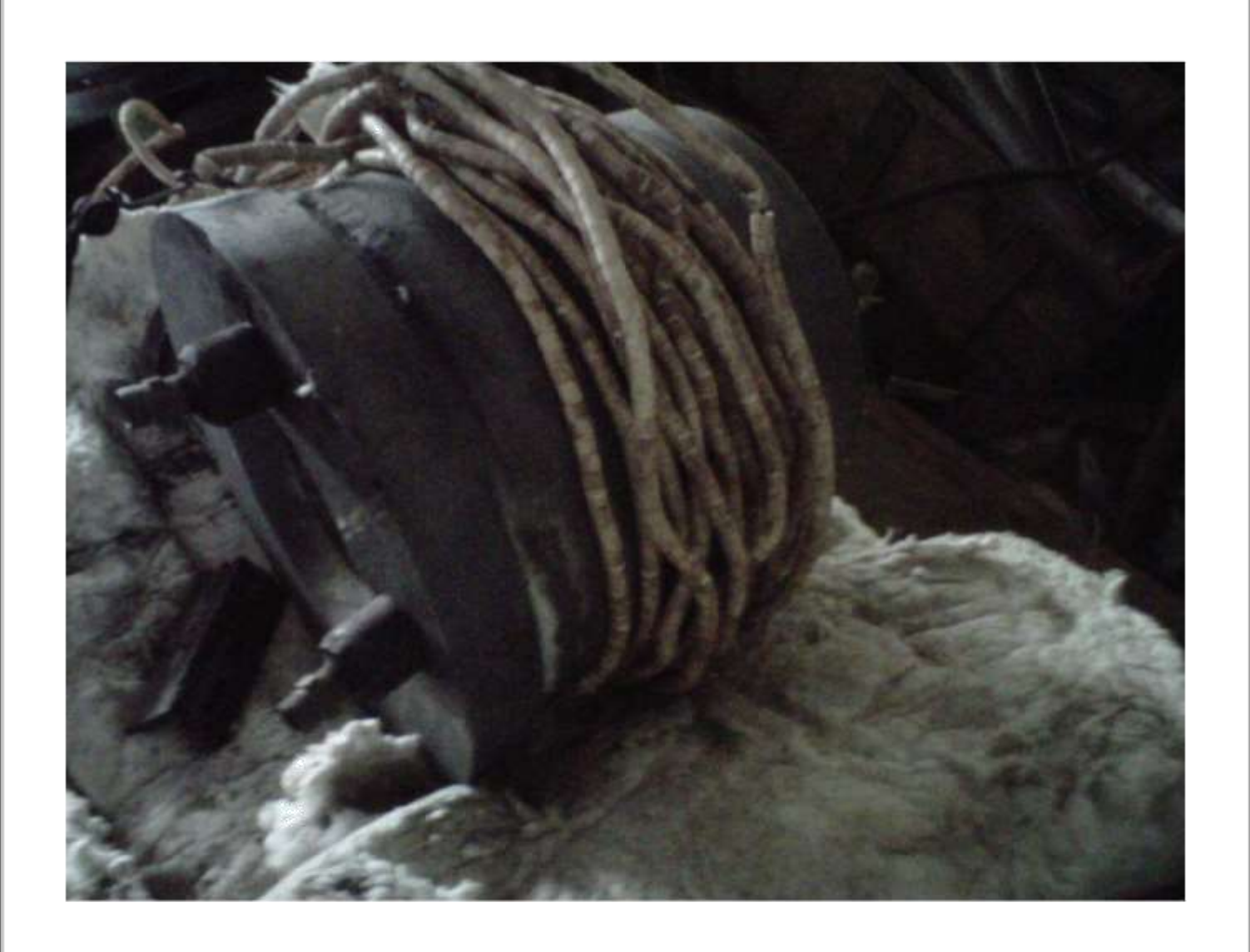
COPPER WELDING ON TUYER