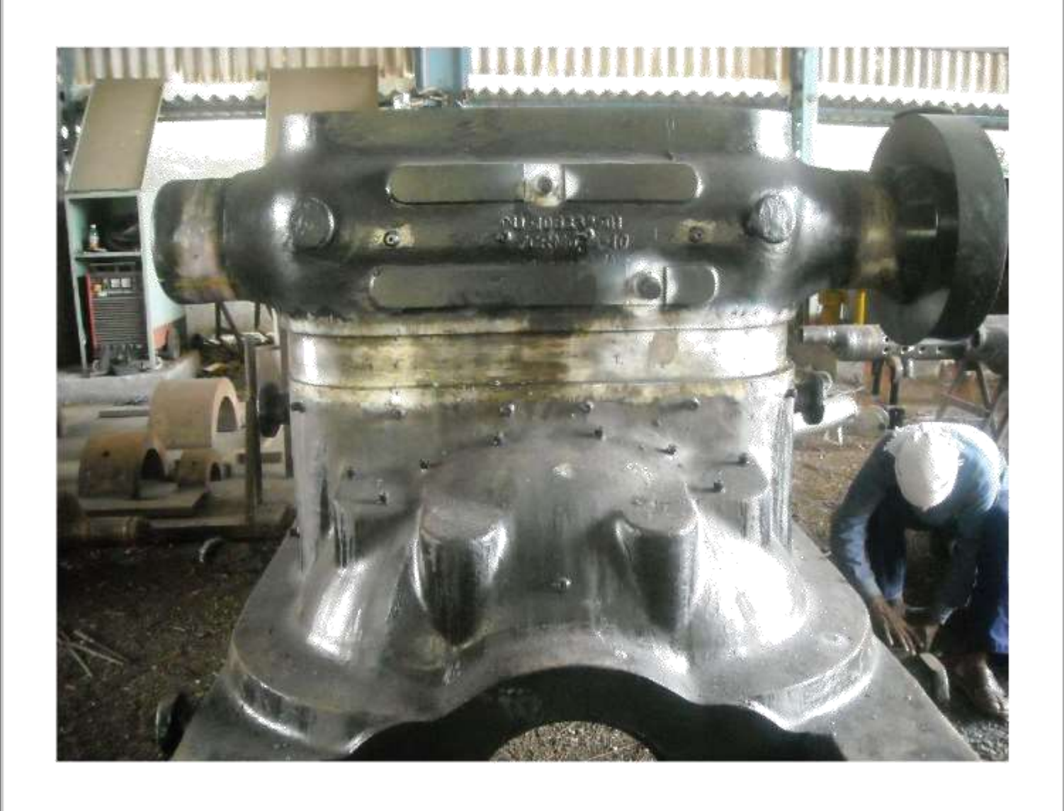
WELDING OF A TURBINE CASING