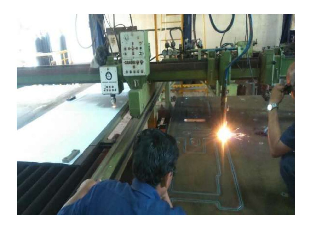
OPTICAL PLATE PROFILE CUTTING MACHINE -300MM THICK-2.5MTRX8 MTR