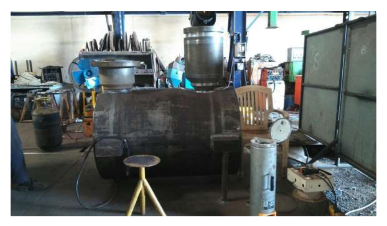
NOZZLE WELDING ON PUMP BARREL CASING