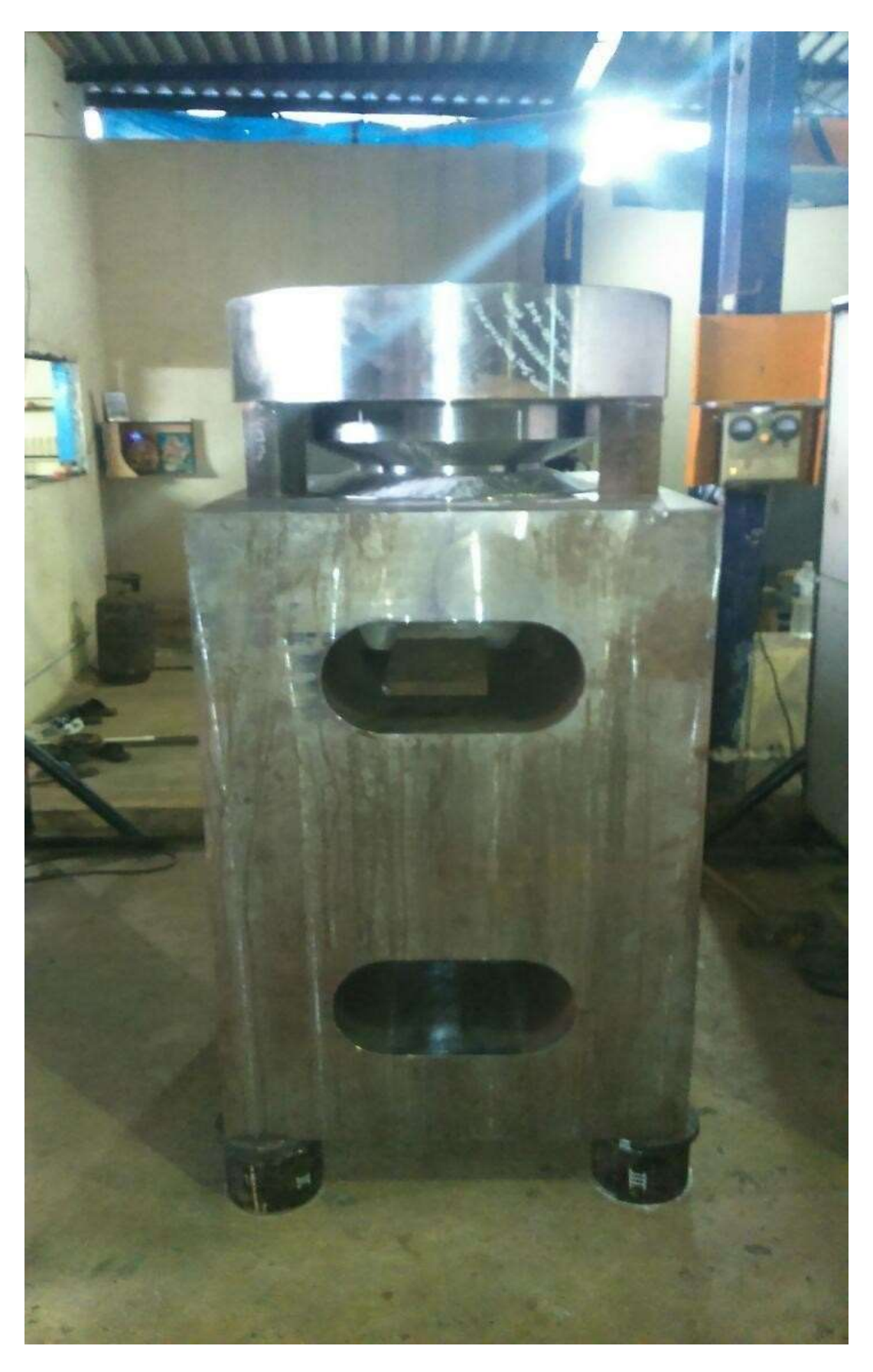
NOZZLE WELDING ON VALVE BODIES FOR OIL & GAS INDUSTRIES