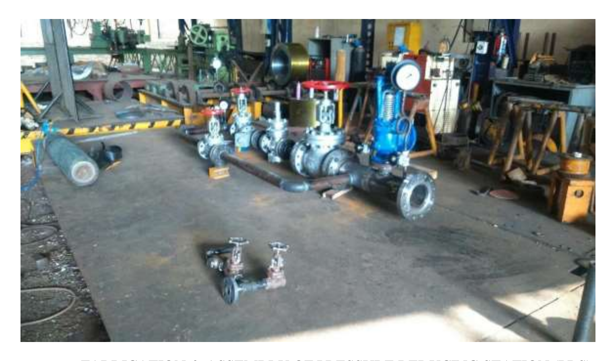
FABRICATION & ASSEMBLY OF PRESSURE REDUCING STATION (PRS)