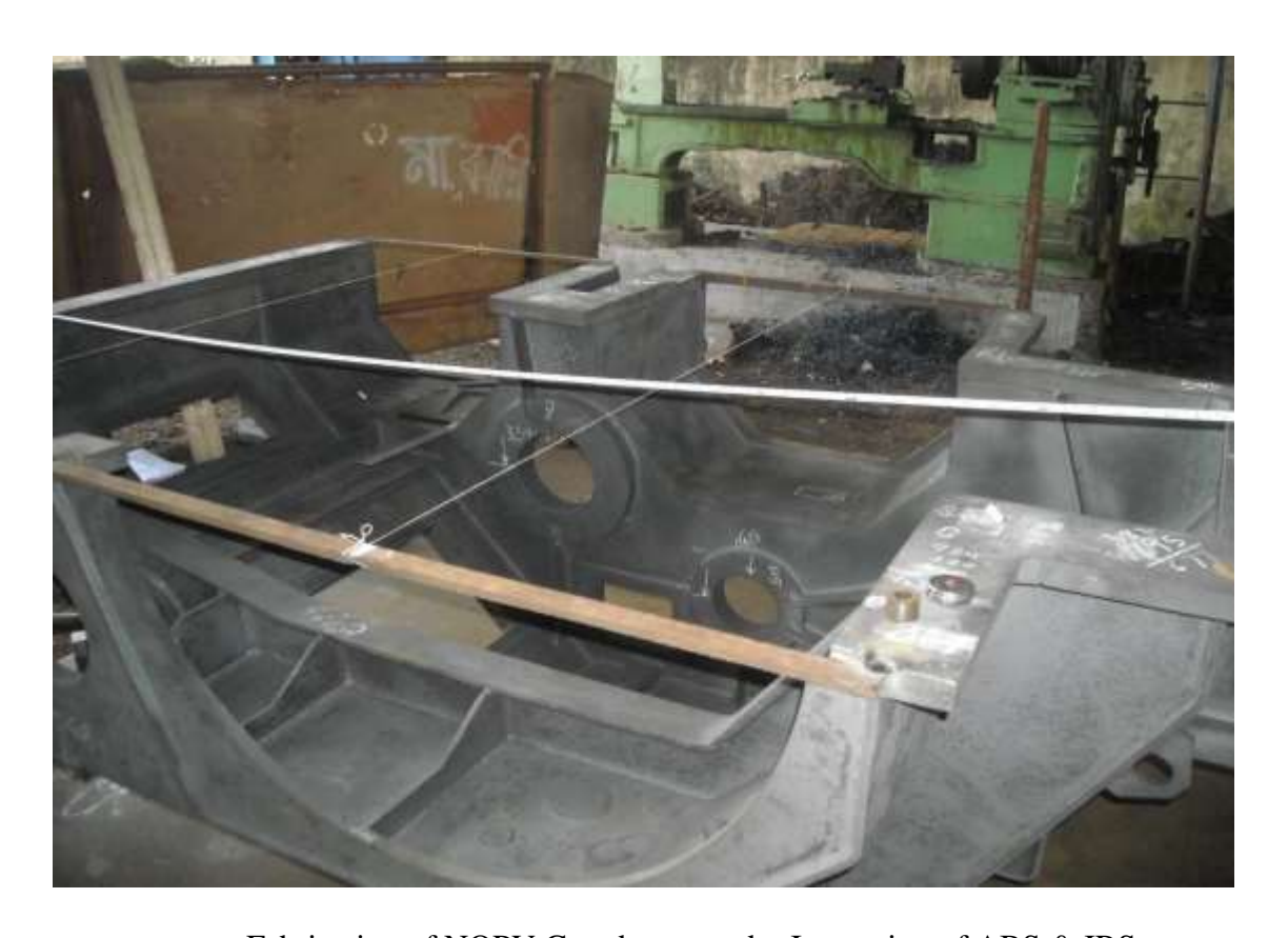
Fabrication of NOPV Gear boxes under Inspection of ABS & IRS