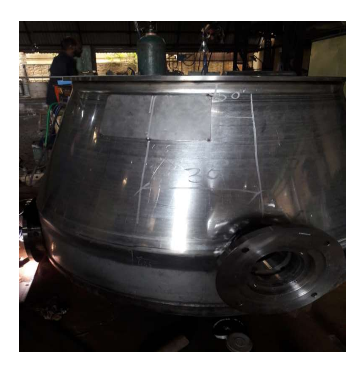
Stainless Steel Fabrication and Welding for Pharma Equipments (Product Bowl)