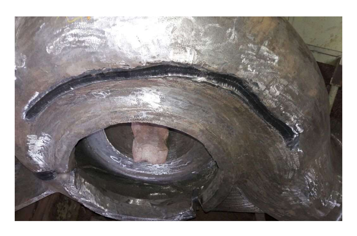
Repair and Maintenance work ( Specialized Welding)