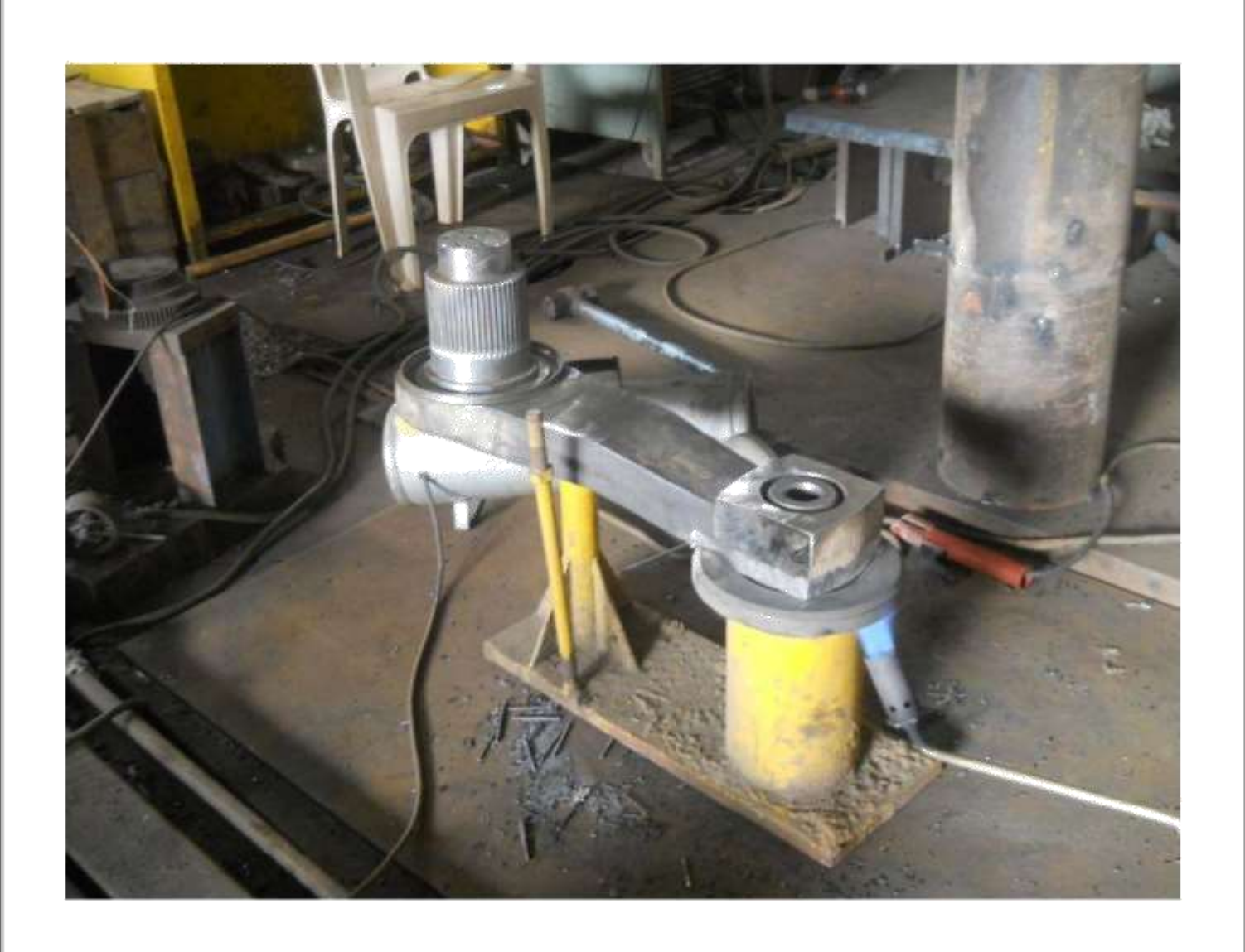
AXLE ARM WELDING OF ARJUN TANKS