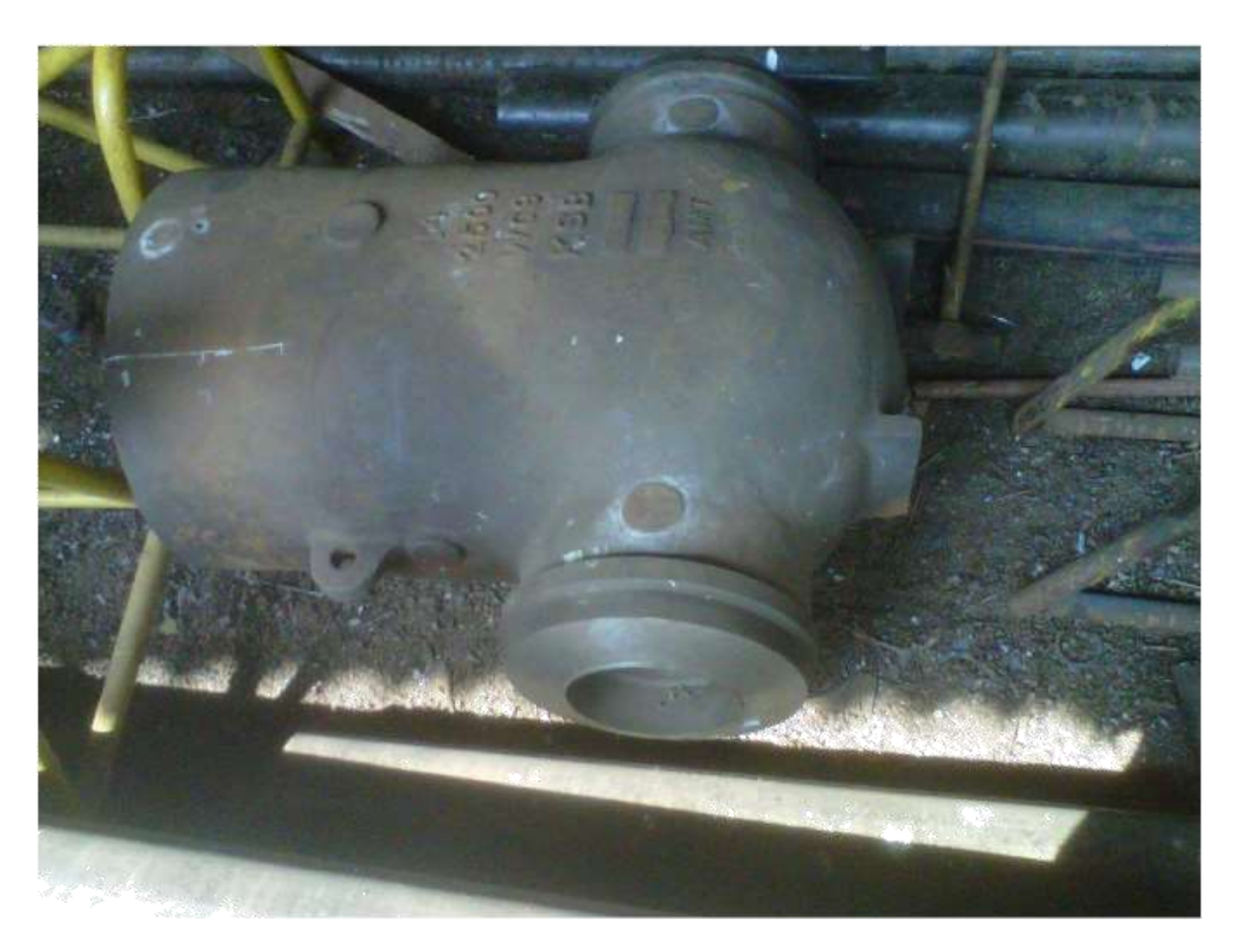
SEAT RING WELDING ON VALVES