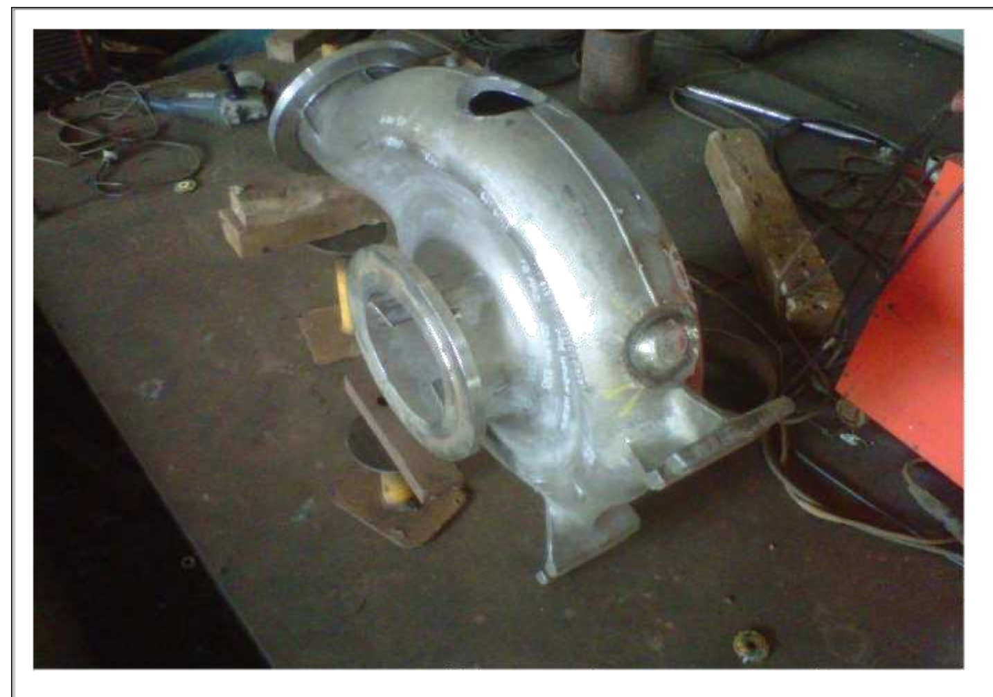
WINDOW WELDING ON A GLOBAL PUMP