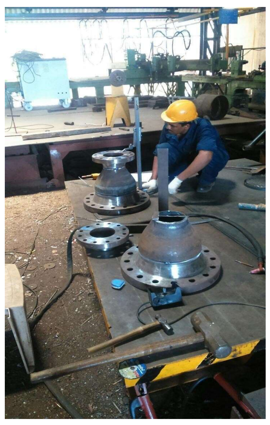
FABRICATION & SUPPLY OF SPOOL PIECES TO KSB PUMPS LTD (IBR & NON IBR) MATERIALS A105 & SS316L