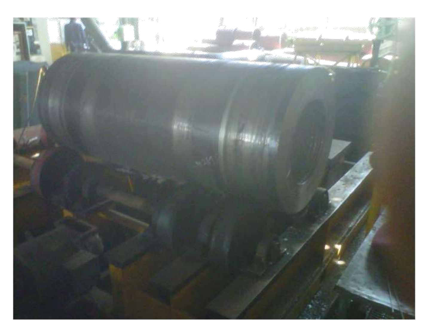
SS309L(BY WELDING) CLADDING ON BARREL CASING