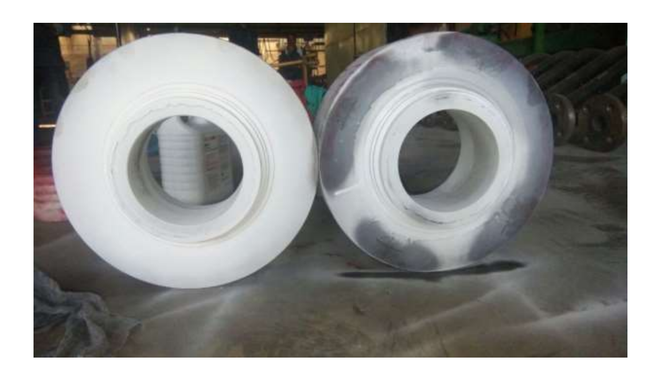
SS316L & Inconel 625 Overlay on Ball Valve Bodies