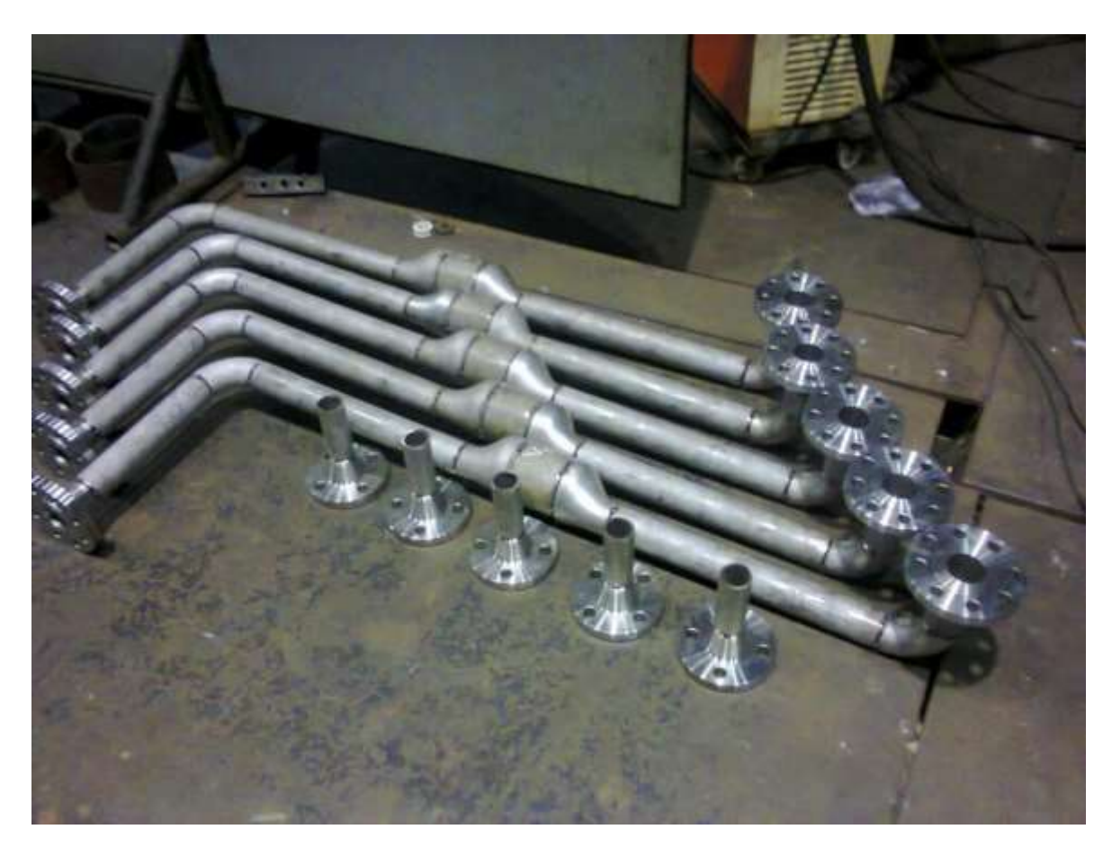
FABRICATION OF BALANCING LINE PIPING FOR KSB PUMPS AS PER IBR1950