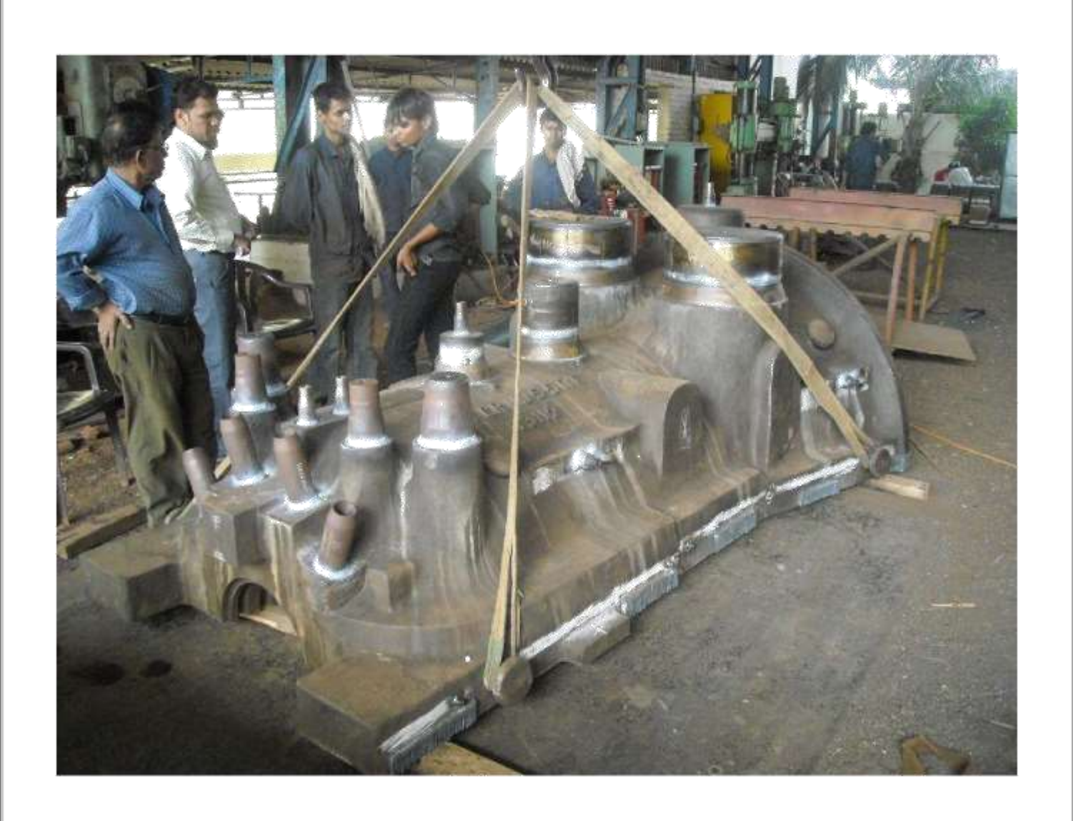
NOZZLE WELDING ON A TURBINE CASING